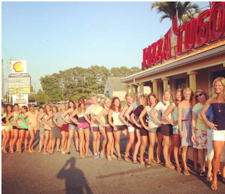
Having fun at the OCBP Women's Dinner June 25 Pizza Tugos