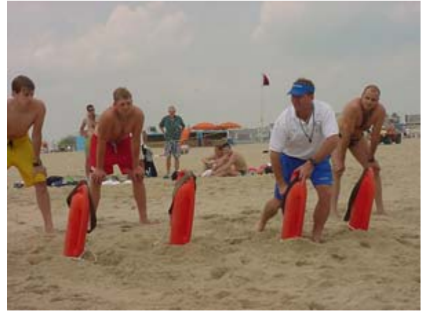
Testing officers demonstrate the proper use of the rescue