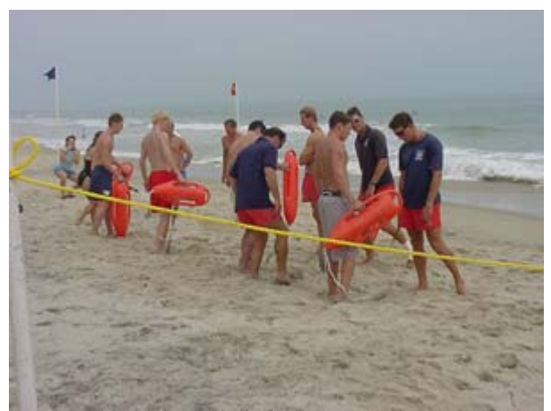
On Site Testing

Once you pass the soft sand run and the distance swim, you will be instructed on how to perform simulated water rescues. A testing officer will describe the rescue buoy, the rope, and the straps. You will be taught how to position the buoy, prepare for rescues, and scan the water. A series of repeat water rescues will be assigned to reinforce learning. The instructor will teach and demonstrate procedures for both entering and exiting the water safely. Ultimately, the candidate will be taught how to effectively make an intervention with both passive and active victims and safely return them to shore.