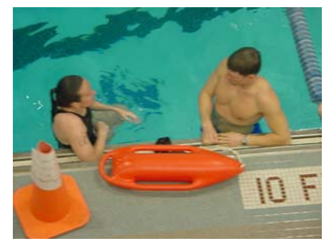
The rescue is complete and the candidate gets feedback from the victim (instructor).