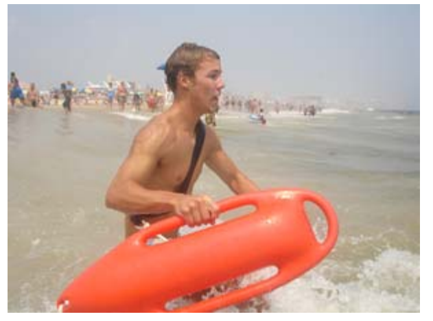
This candidate charges the water on his way to a practice rescue.

Testing officers demonstrate the technique of donning the strap before heading out to rescue a victim.