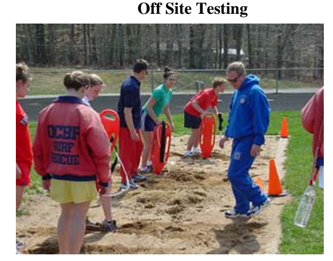
Testing officers demonstrate the techniques for placing the buoy in the sand "planting the buoy."