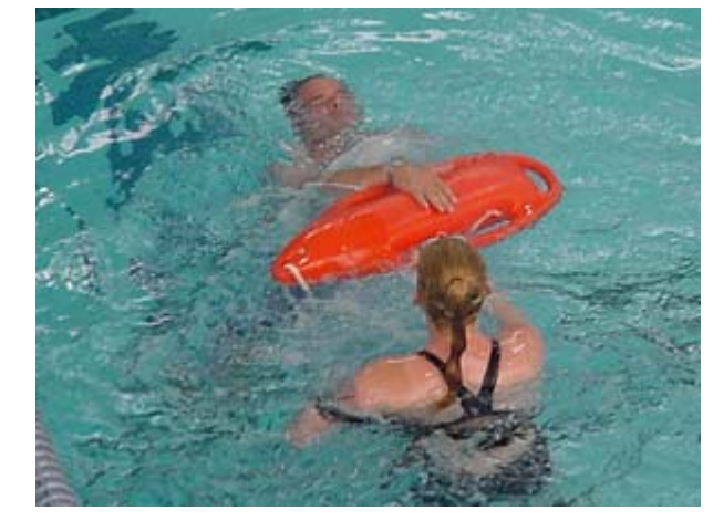
The candidate intervenes with the awaiting victim.