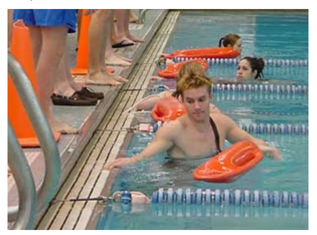
Candidates prepare for an in-water start.