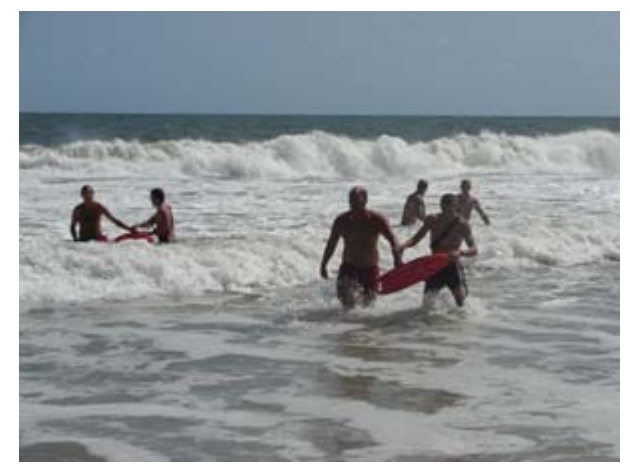
Finally, the victim is brought ashore.