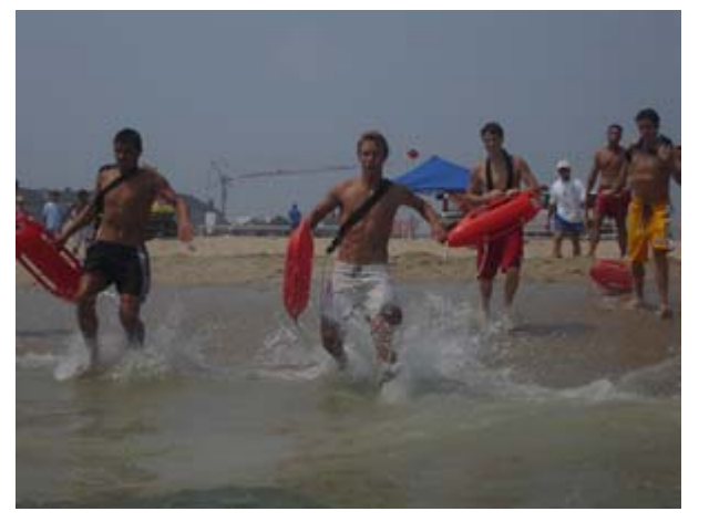
These candidates prepare for "dolphining" out through the surf.