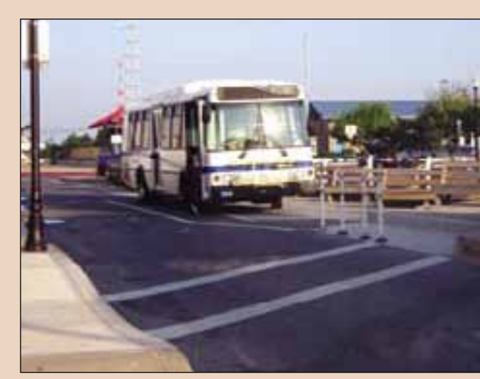
ADA-accessible curb cuts at the South End Transit Center.

For more information, call 410-289-2695 or visit www.oceancitymd.gov.