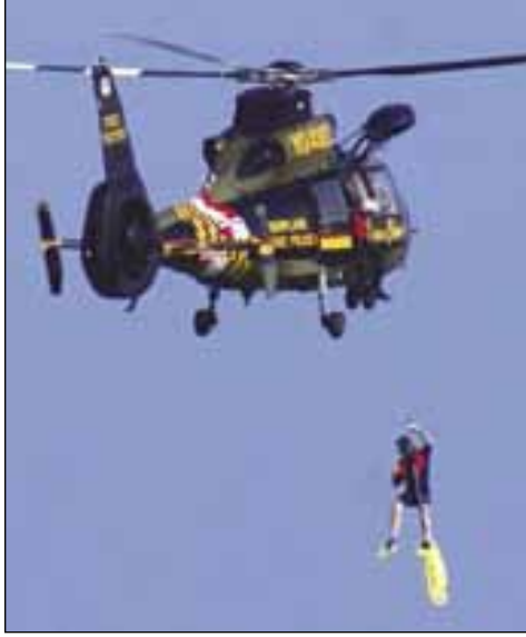
An OCBP member is lowered from the MSP helicopter during training.

Since the most dangerous time for swimmers at the beach is in the evening, after the lifeguards go off duty, MSP and OCBP discussed the plan of using guards during extended evening patrols to look for rip currents from above so that they could then radio information to emergency responders on the ground. Talks progressed to the idea of actually deploying a swimmer from the helicopter.