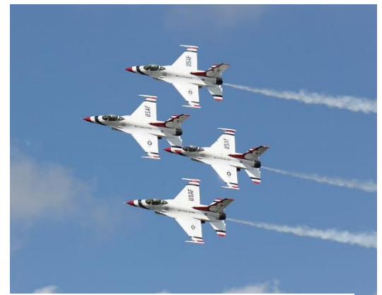
Thunderbirds in Action

Beach Bonfires: 30 th , 57 th , 127 th , 138 th