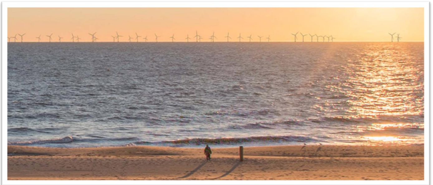
Rendering of shoreline view of wind turbines

Unfortunately, our natural viewshed is in danger of being changed forever. As you may or may not know, two companies are planning to build offshore wind farms directly off of Delaware and Maryland beaches. An Italian company (U.S. Wind) plans to construct dozens of 853-foot-tall wind turbines, located on 46,595 acres (73 square miles) of Atlantic Ocean, as close as thirteen miles from our beloved beach. This project will forever change the natural beauty of our beach, not only for us but for future generations.